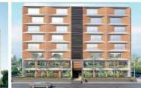
Indraprasth Business House (Showrooms & Offices)