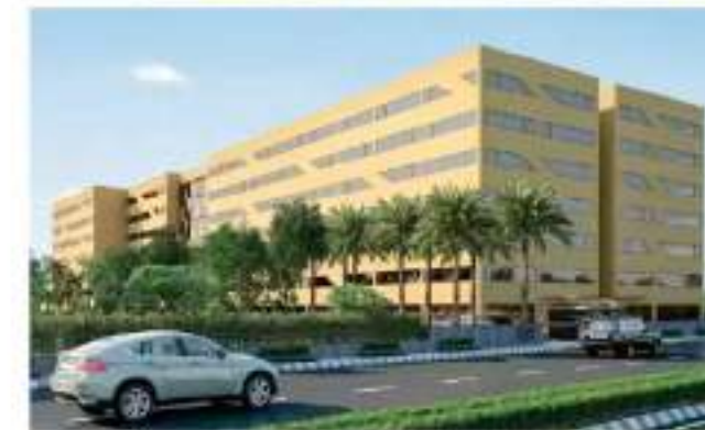
Indraprasth Business Park (Corporate Offices)