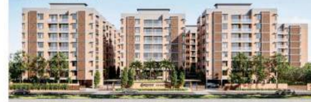
Indraprasth Greens (3 BHK)