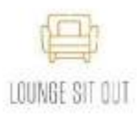
LOUNGE SIT OUT