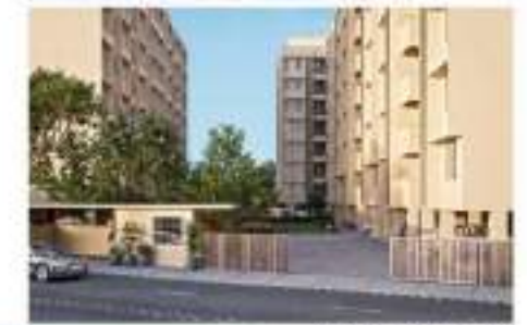
Indraprasth Homes (2 BHK)